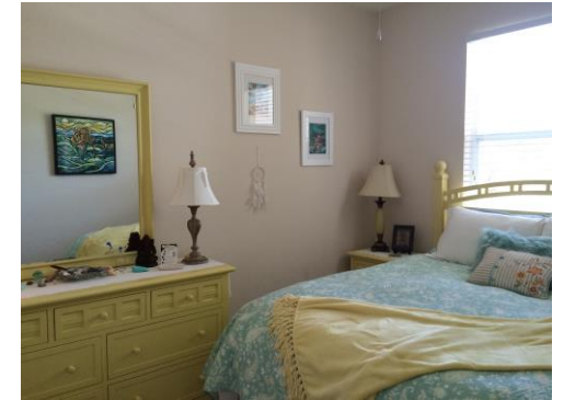
Casa Linda's Luxurious Guest SeaScape Suite Awaits You!