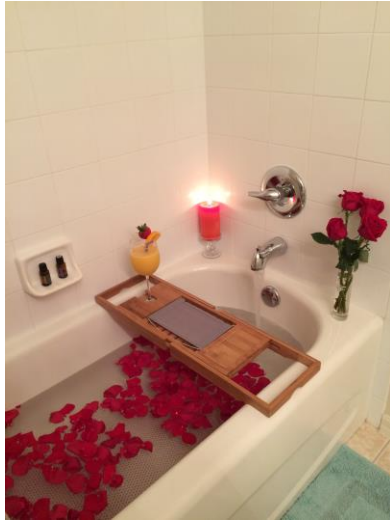
Ease Tension Away in a Soothing Epsom Salt Bath with Rose Petals, Essential Oils and Relaxing Meditative Music